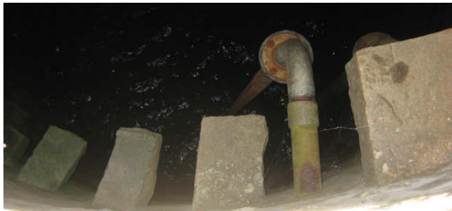
Reservoir from 3 wells