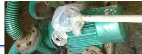
Pump from 3 wells (can be Solar)